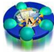
First Class Client

Step 3: Once complete, a First Class Icon will appear on your desktop. Double click this icon from your desktop to launch the program.